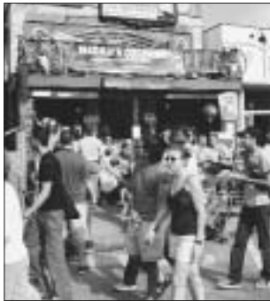
(from 2003 festival)